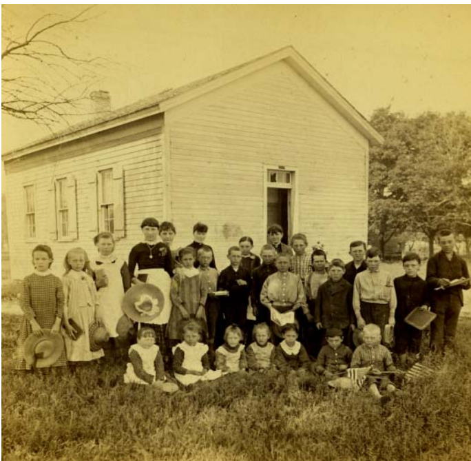
One Room Schoolhouse of Plato Center, 1904