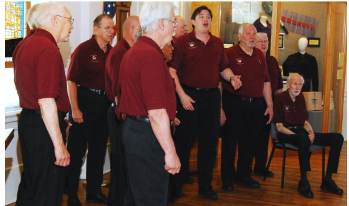
Fox Valley Men of Harmony at the Museum

In the bicycle theme, our Aug. 18 Brown Bag Lunch will feature information about Elgin bicycles. We hope you will join us then and on July 21, to hear about Elgin in the 1950s.