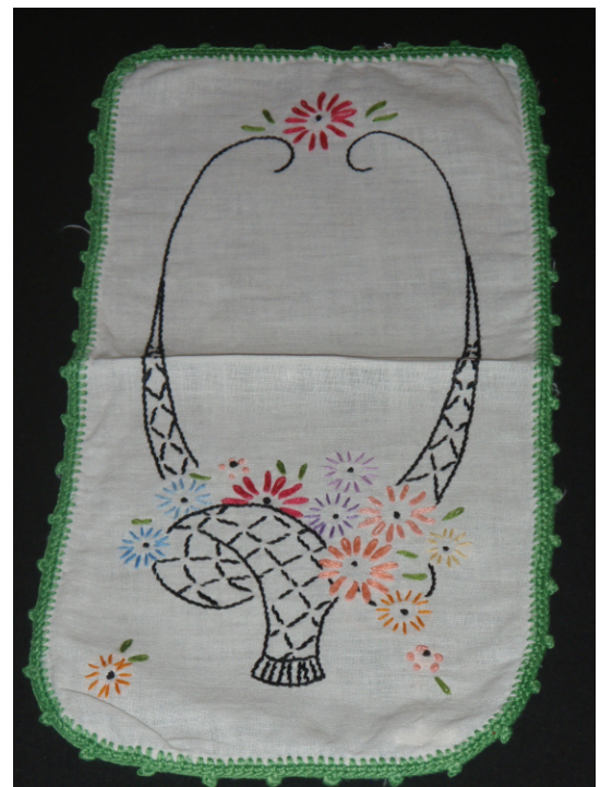
LeeWards embroidery kit item

Susan Wildemuth donated more LeeWards/Dexter Thread items to enhance the new exhibit on LeeWards Kit Quilts opening in September.