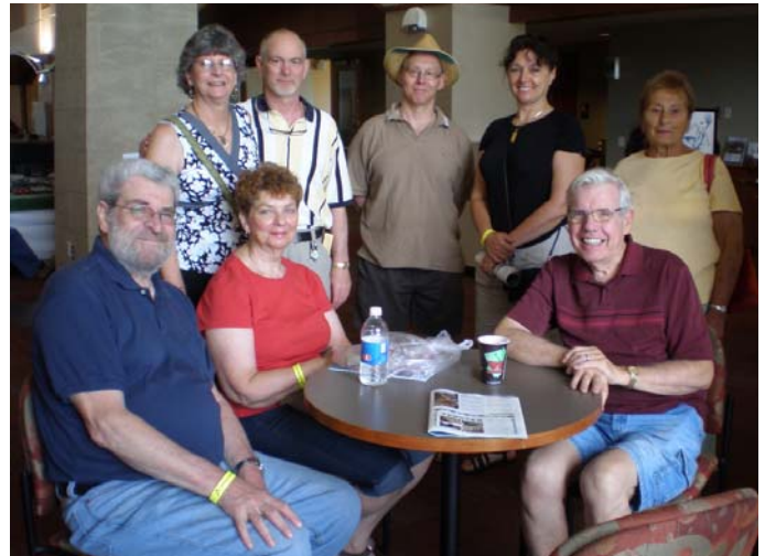
Elgin Historical Society members at the Kenosha Civil War Museum