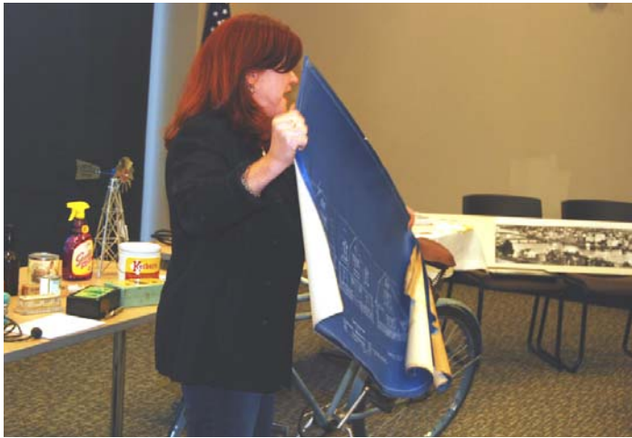
Original house plans found in a basement