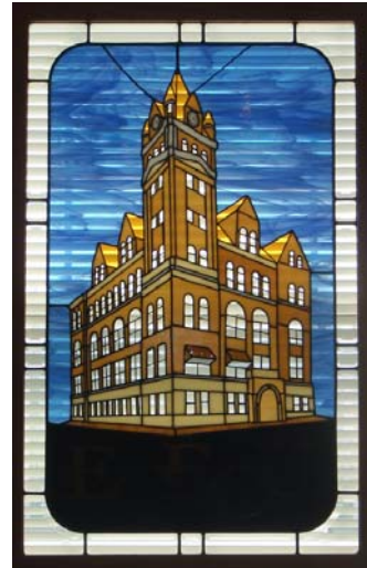
Old Elgin City Hall, rendered in stained glass