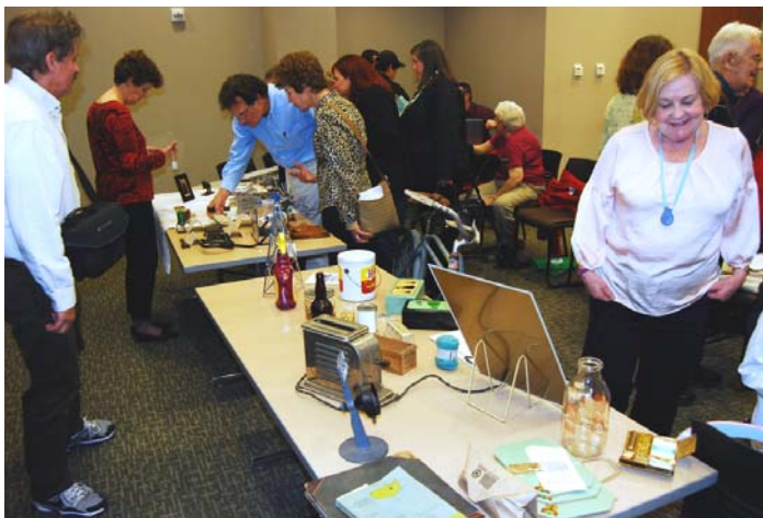
Many interesting Elgin products were brought in.