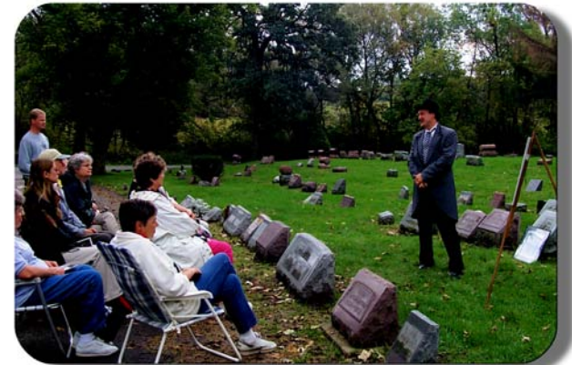
The annual Historic Elgin Cemetery Walk is held on the fourth Sunday in September at Bluff City Cemetery.