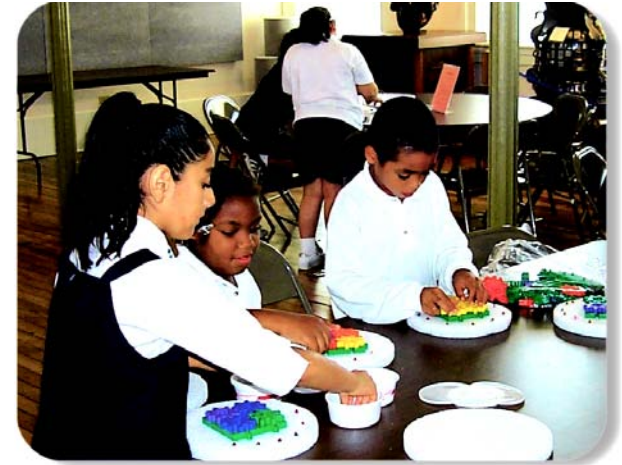
Local schoolchildren learn about assembly line production in one of the Museum's educational programs.